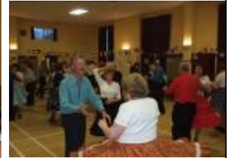
Some of our visitors