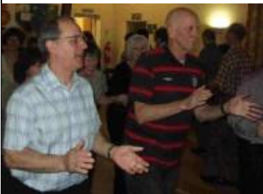
AT LAST! A photo of the man himself.

Finally, the main reason for the dance was to raise money for our chosen charity: the Northern Air Ambulance. The amount raised was £514, a major success.