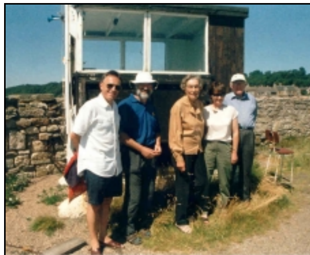
Officers of the day at the Regatta