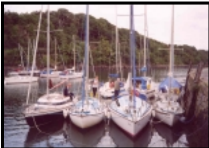
Waiting for Crystal Clear to arrive at Aberdour.