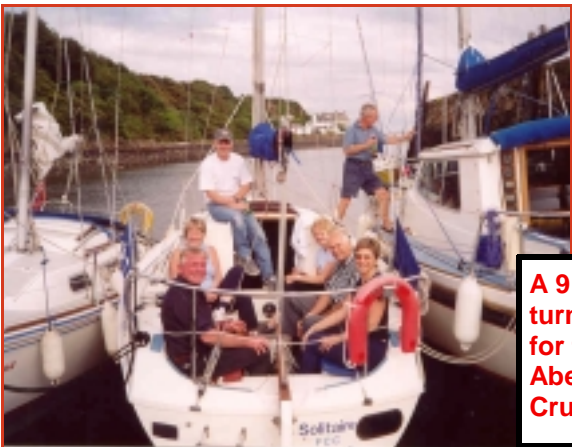
A 9 boat turn out for the Aberdour Cruise