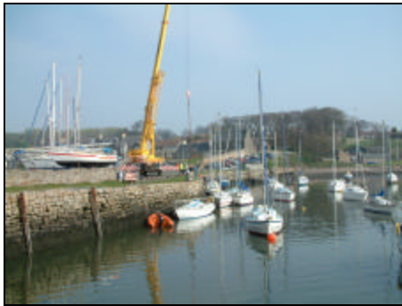
Crane in 2007