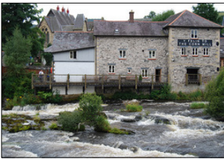
The Corn Mill

Lively tied house near train station. Bar, restaurant, games room and upstairs function room. Outdoor seating. Food. Bed.