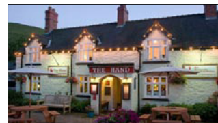
The Hand, Llanarmon DC

Homely welcoming hotel. Several rooms. Pool. Fire. Hand sculpture outside. Beer garden. Food. Bed.