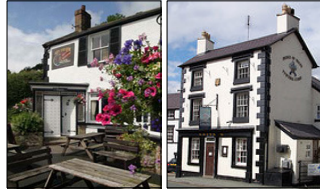
The Sun Trevor (left) The Prince of Wales (right)

Local's pub. Snug front bar. Rear room features live music.