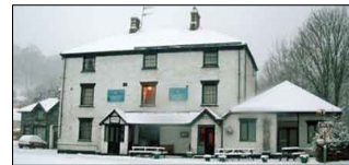
Glyn Valley Hotel

Hotel in centre of village. Lounge, bar, dining and function rooms. Local photos on walls. Food. Bed.