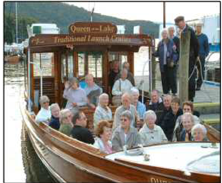
Happy members prepare for their boat cruise on Lake Windermere.