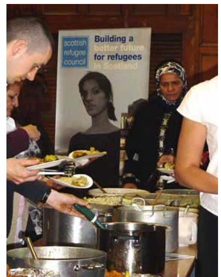
Refugee week 2004, Scotland