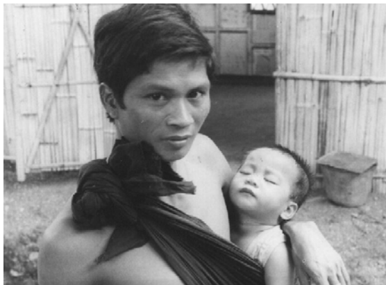
Lao man and child, Phanat Nikhom, Thailand