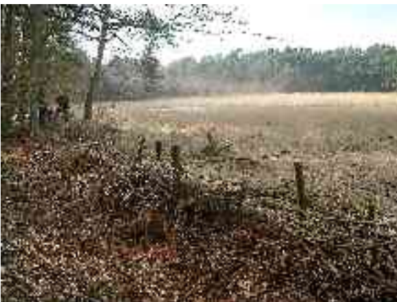
Above – the existing deadhedge Below left – cut stumps in the reedbed

provide the main structure, & then wove in the cut branches to form a strong dead hedge.