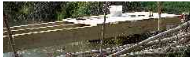
Above – various construction shots. Left – Tea break.