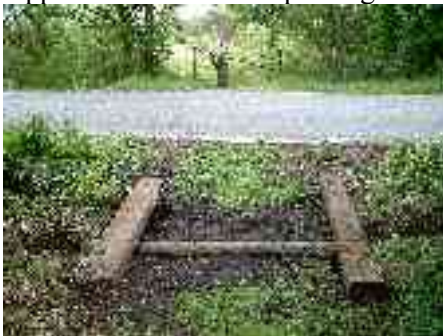
Above - Almost complete culvert Below – Local wildlife

I arrived late to find everyone putting the ‘finishing’ touches to the first task of the day – installing a culvert to take a ditch under one of the paths on the site. This was not quite a complete job, as a mix up by the supplier meant that the special gravel fill was being delivered a week late. Adrian was going to come back and finish the job when it arrived.