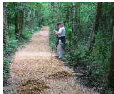
Anna raking out the hogging

June's task at Snelsmore involved resurfacing a RUPP / bridle way close to the main car park. Most of us were on barrow duty transferring gravel from the gravel store to the path, whilst Anna raked and tamped it smooth. A small drainage ditch