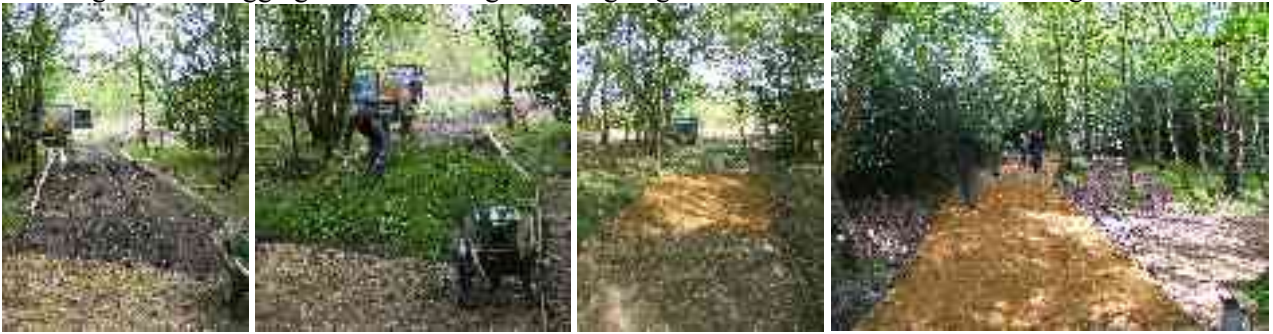
L-R: Before; during; after; and walking back to the van over the path resurfaced on previous tasks.

We spent today extending the bridleway surfacing we have done on previous tasks here. We didn't quite have time to get all the hogging down. The rangers were going to come back and finish off during the week.