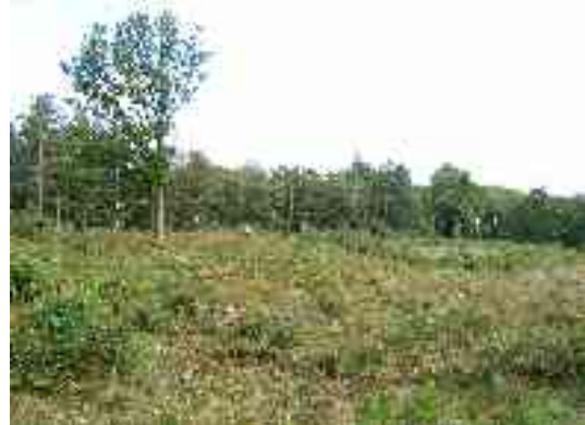
Before & after shots of Snelsmore Common, showing the area cleared.