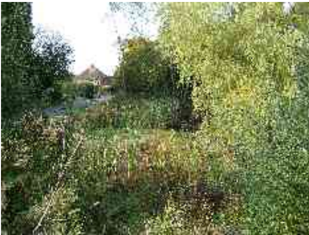
Above - View across the pond. Right – At work in the pond.