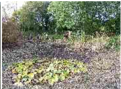
Above left & right & below – at work in the pond. Above centre – local publicity for the event.