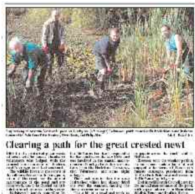
Above – copy of the newspaper article

4 th September – Snelsmore Common, 18 th September – Pound Copse, 25 th September – Greenham Common No task reports.