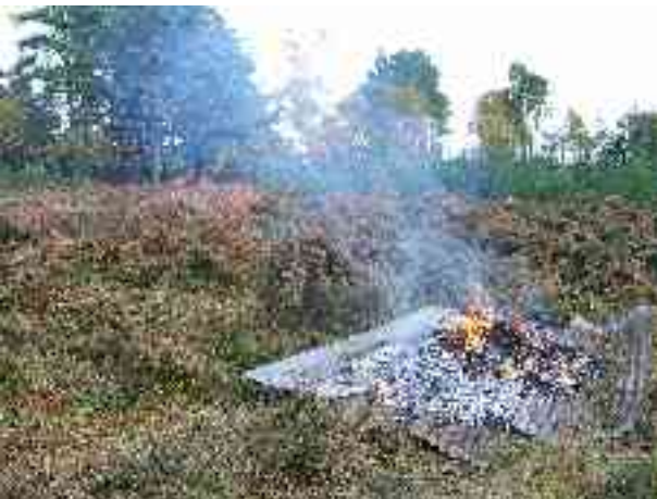
Above & left – the bonfire & heath at Wildmoor.

and we had to watch the fire to ensure it didn’t spread. Those that were cutting did a good job of keeping the fire supplied, and we made a good impression on the heath. The job was finished off by transferring the contents of a nearby ditch to the fire, to ensure it was well and truly out.