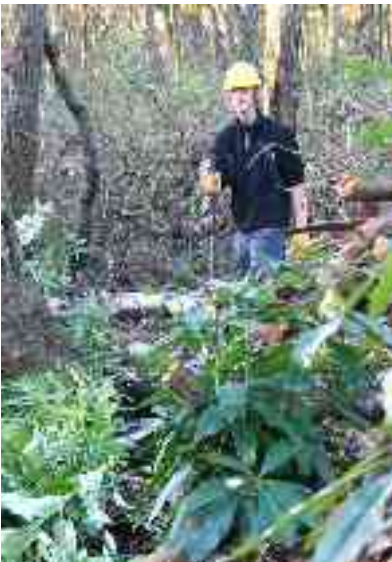
Winching rhody roots

We spent today chopping down more of the birch scrub that is encroaching onto the heathland along the edge of Holt Lane on the eastern side of the reserve. For the first time in three tasks here this year it wasn't raining!