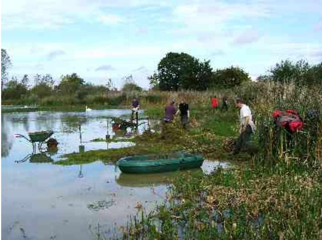
Attacking the Crassula in Lavells Lake

23 rd October – Lavells Lake – David Fiddes