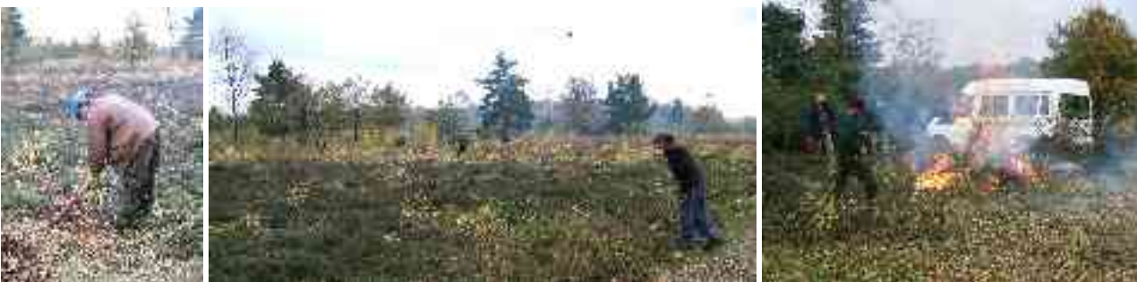
Above left – Phil mattocking up birch scrub. Above middle – view across the worksite. Above right – No we’re not setting the van on fire!

This was a joint task with Oxford Conservation Volunteers, held after they contacted us to suggest the idea. We’ll be holding the ‘return match’ at one of their regular sites in January. Today’s task was clearing small birch scrub across the open heath near the car park, and some bigger stuff in amongst the gorse. The usual bonfire and spuds finished the day off.