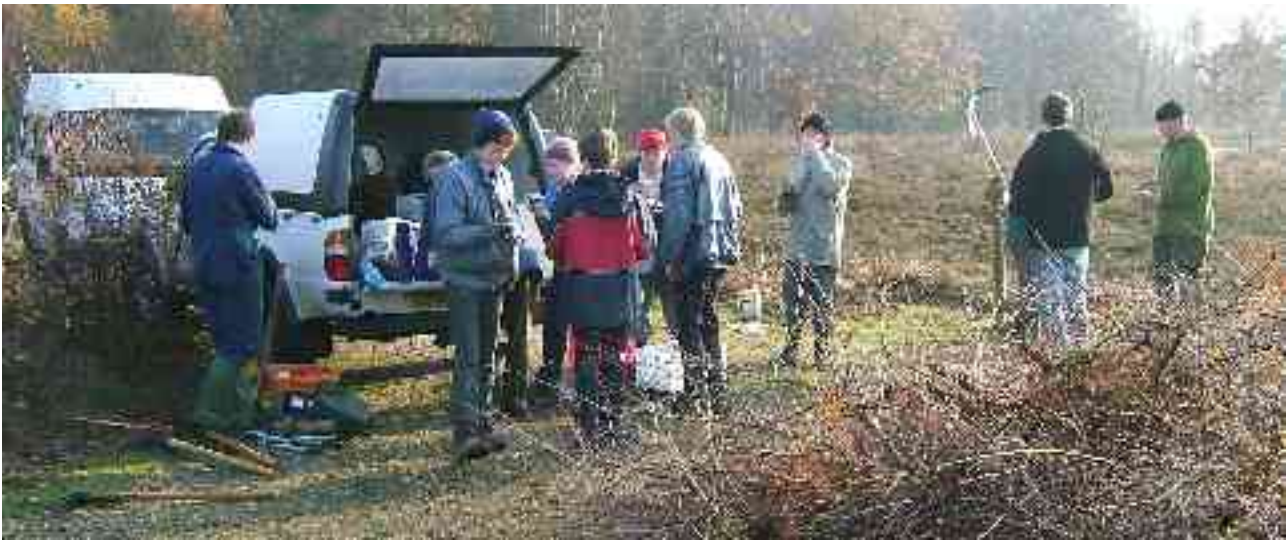
Above – enjoying spuds & mulled wine. Below left – watching the fire. Below right – the smoke made for a more atmospheric sunset than usual.