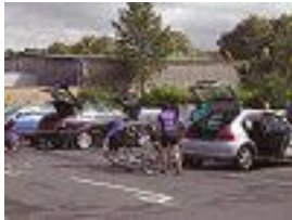
The Rough Riders take over Meltham car park. Roger is popular!