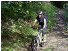
You can find rocky descents even in Honley Woods