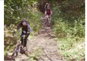
A visitor from Foreign Lands?