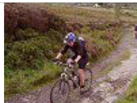
It's a long way to the top! Climbing Harden Moss Road is tough!