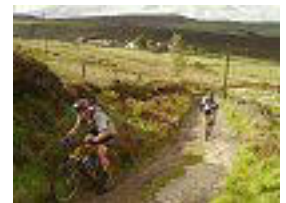
The good thing about this ascent is the whizz down nearby Harden Hill Road.