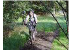
Plenty of new faces. Saturdays are a good choice for folk sampling the WYRR