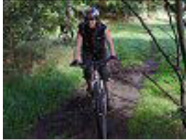
We usually start at 1.30pm but ring the ride leader on Friday night.