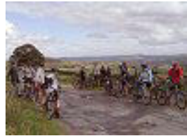
The clouds part and the sun comes out. Below Deer Hill Reservoir. Before the mud!