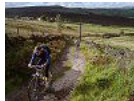
It's a rough track (Walker's identity concealed to save blushes)