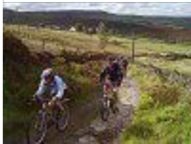
Sarah's hill-climbing practice in the Scout ride pays off!

My apologies to those who smiled dutifully but are not included. I overestimated the capacity of my memory (and the camera's...) and ran out of "film!"