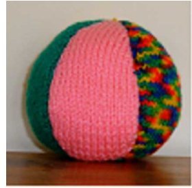
Ball See Page 18