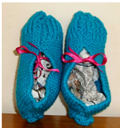
Cosy Feet Slippers See Page 23