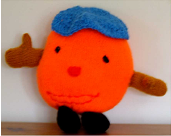
Mr Man See Page 34