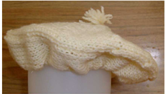
Childs Beret See Page 19