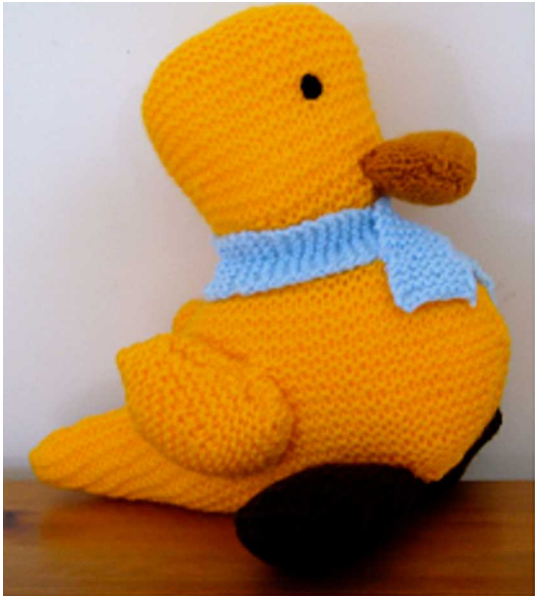
Duck See Page 38