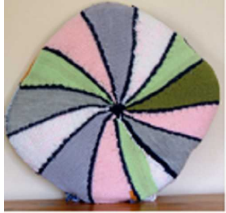
Round Cushion Cover See Page 22