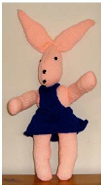
Rabbit See Page 48