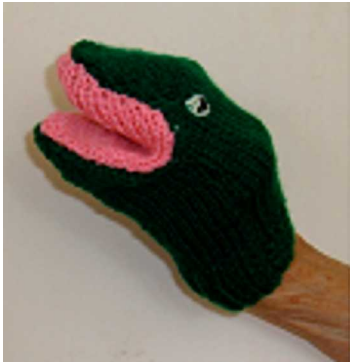
Frog Puppet See Page 20