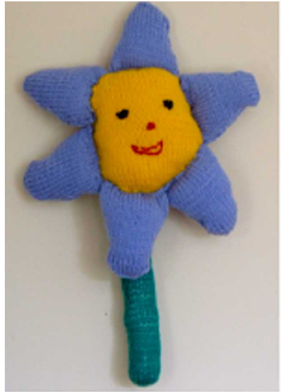
Flower See Page 41