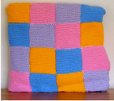
Patchwork Cushion Cover See Page 12