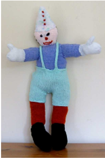
Clown See Page 29